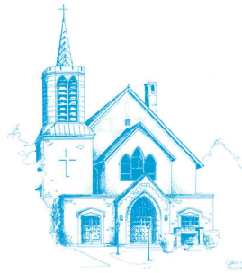
St. Columba & St. Patrick