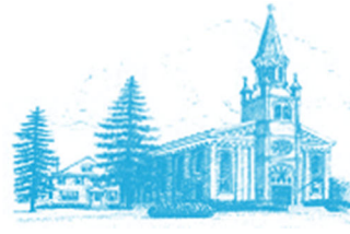
St. Mary of the Assumption